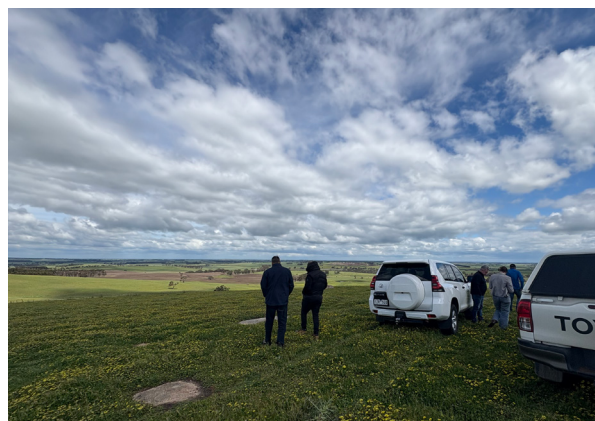
Squadron Energy and WTOAC Executives on Country

The teams engaged in open and respectful dialogue that deepened understanding of Wadawurrung cultural heritage, connection to Country, and how the project could deliver lasting benefits for Wadawurrung people. Squadron was also warmly welcomed with a traditional smoking ceremony.