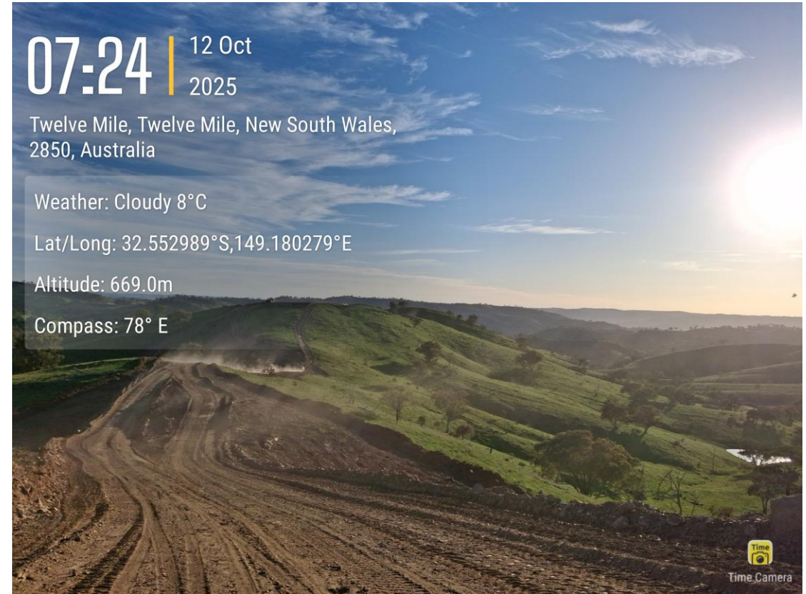
Civil Area 7 – Track 7-1 to WTG 51