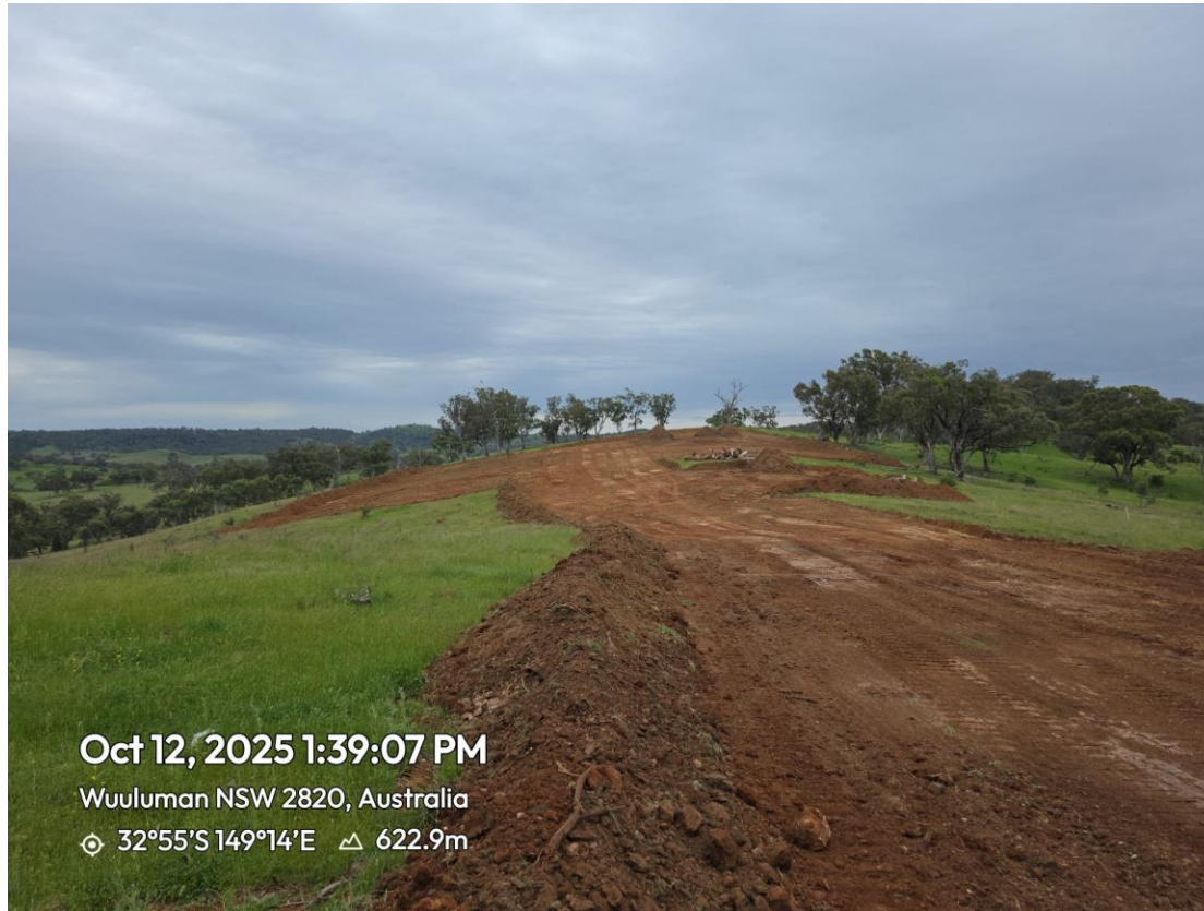
Civil Area 4 - WTG 98