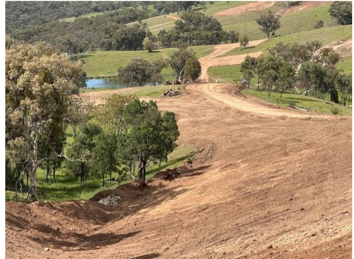
Civil Area 4 – WTG 97 Track 4-2