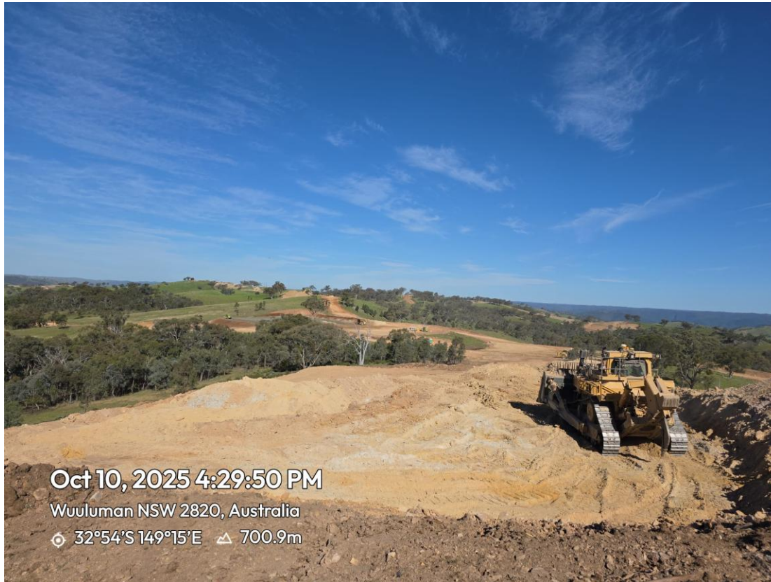
Civil Area 3 - WTG 33