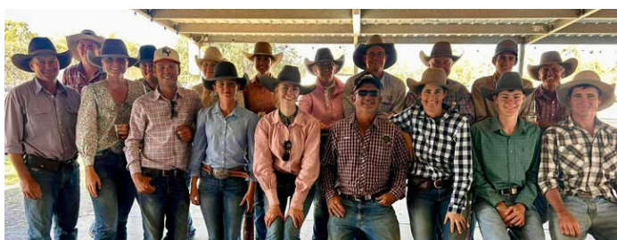
Previous community grant recipients Clarke Creek Campdraft Committee

More than $163,000 has been awarded, supporting a range of initiatives across communities near the wind farm, including upgrades to local community facilities. These grants reflect Squadron Energy's commitment to investing in projects that strengthen community connections and deliver practical, lasting benefits for the region.