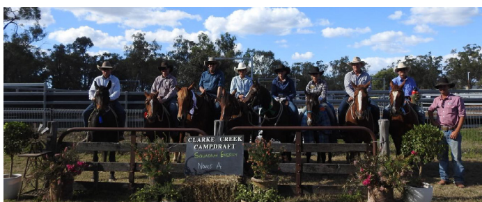
Winner of the Squadron Energy sponsored event